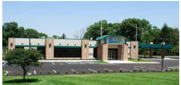
Incenta Federal Credit Union, Englefield, Ohio

It’s simply human nature. If cost is more important to you than the quality of construction, profit will be more important to your contractor than the quality of their work.