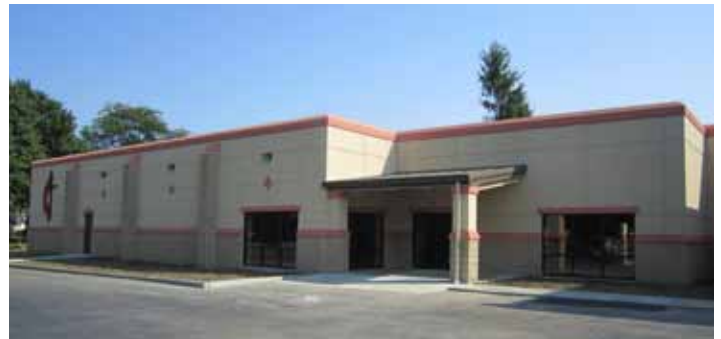
St. Paul's United Methodist Church, Galion, Ohio