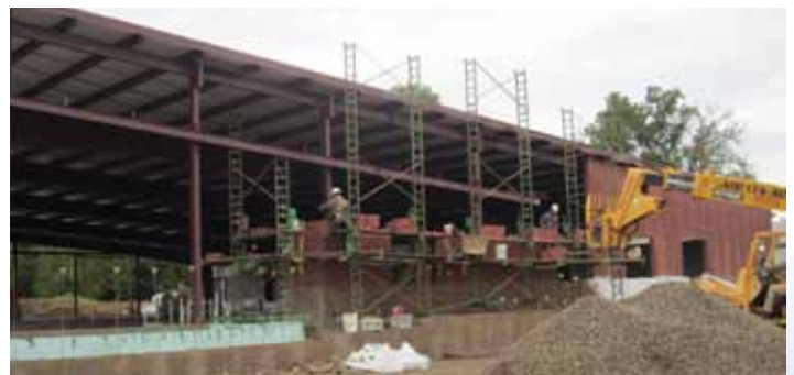
Mt. Vernon Nazarene University, Mt. Vernon Ohio